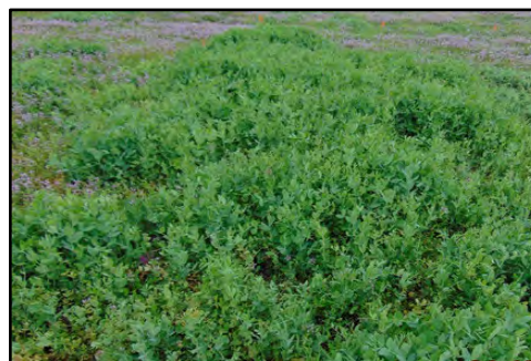
Arvica 4010 (yellow) had poor winter survival in Missouri both years. Survivor 15 (red) had the highest winter survival in Kansas and Missouri. Early spring growth of Survivor 15.