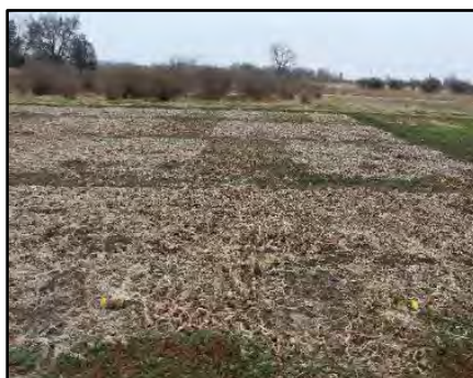
Daikon radish varieties provided quick fall cover in Kansas, Michigan and Missouri but did not survive the winters.