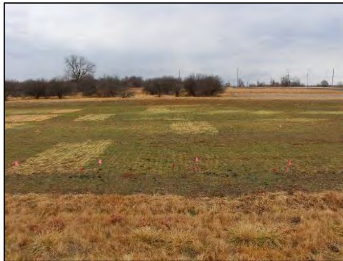
Early winter growth of hairy vetch varieties in Elsberry.

Expected Adaptation: Hairy vetch varieties provided good, quick fall cover in East Lansing, MI and Elsberry, MO and fair fall cover in Manhattan, KS. All varieties provided acceptable fall stand quality except Lana in Manhattan, KS in 2016. Winter survival was good to excellent for all varieties across locations and years. Varieties were similar in days after planting to maturity (50% bloom) and varied across locations. None to low insect or disease damage was observed on any variety.