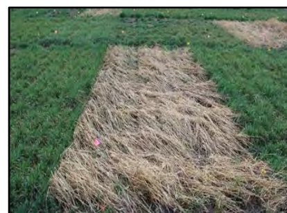
Merced (center) and FL 401 (upper right) had poor winter survival for both years in Kansas, Michigan and Missouri.

Expected Adaptation: Most cereal rye varieties exhibited good to excellent fall cover, low disease and insect problems and excellent winter survival except for FL 401 and Merced, which overwintered poorly at all locations both years. For producers seeking a cereal rye variety that produces a quick fall cover with acceptable fall stands that may not require chemical or mechanical termination in the spring, Merced or FL 401 may be good choices for incorporating into a cropping system.