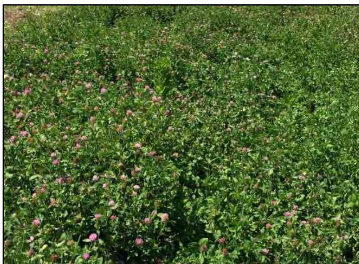
Late spring growth of Mammoth red clover in Missouri.

Expected Adaptation: Red clover varieties generally had good quick fall cover in East Lansing, MI and fair to poor in Manhattan, KS and Elsberry, MO. Fall stand quality of the varieties was only acceptable in East Lansing, MI. Overall winter survival was excellent to good among varieties, but they winterkilled in Manhattan, KS in 2017-2018. All varieties were similar in maturity (50% bloom) but varied across locations. Insect and disease damage was none or low.