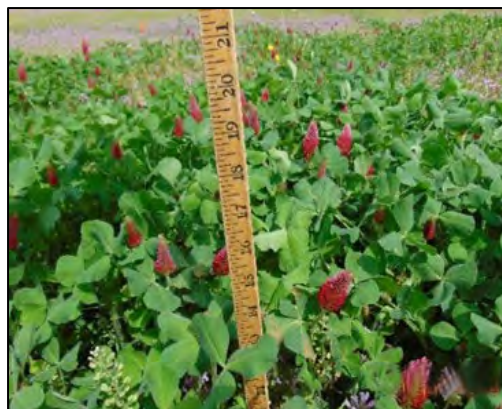
Late fall growth of crimson clover plots in Elsberry, MO (left). AU Sunrise blooming in Mid-April in Elsberry, MO (right).