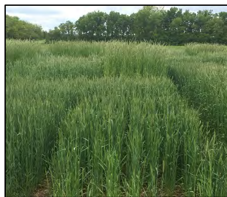
Cereal rye varieties at the Manhattan, KS Plant Materials Center.

Benefits: N scavenger, improves organic matter and soil structure, erosion control, weed suppressor, livestock forage.