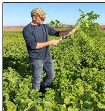
Daikon radish taproot

Benefits: N scavenger, improves organic matter and soil structure, erosion control, weed suppressor, livestock forage.