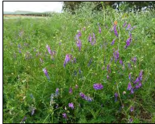
Hairy vetch flowers

Benefits: N source, weed suppressor, improves organic matter and soil structure, pollinator habitat.