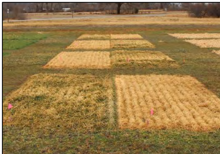
Soil Saver and Cosaque provided quick fall cover and adequate stand quality but Soil Saver winterkilled in Kansas, Michigan and Missouri.

Expected Adaptation: Soil Saver (black oats) and Cosaque (black seeded oat) rated good for quick fall cover and acceptable stand quality across locations and years. Soil Saver winterkilled at all locations. Cosaque had good winter survival at all locations in 2016-2017 and low to marginal winter survival in Elsberry, MO and Manhattan, KS in 2017-2018. Surviving plants were highly susceptible to foliar diseases in Manhattan, KS. Soil Saver may be a good choice for producers needing a quick growing cover crop requiring no chemical or mechanical termination prior to planting cash crops in the spring.