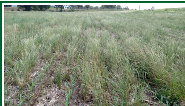
Figure 5. Failed control of annual ryegrass prior to corn planting resulting in crop competition and seed production.

Termination timing in the event another application or different method is required. Occasionally multiple herbicide applications will be required to successfully terminate a cover crop (Figure 5). Early termination allows for flexibility should a second application be needed.