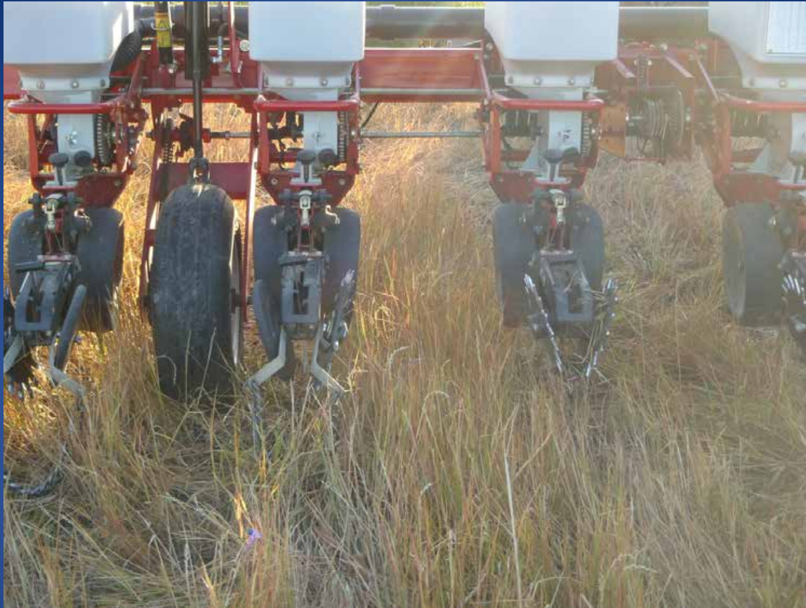
Figure out what tools work best for you