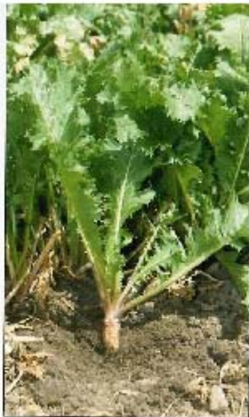
Leafy -7 Top