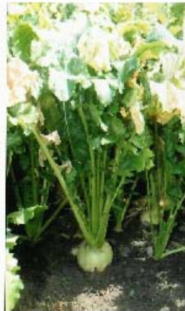
Globe -Purple Top -Green Globe