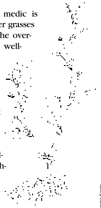
BLACK MEDIC ( Medicago lupulina )

Medics are widely adapted to soils that are reasonably fertile, but not distinctly acid or alkaline. Excessive field moisture early in the season can